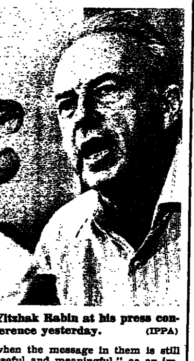
Yitzhak Rabin at his press conference yesterday.